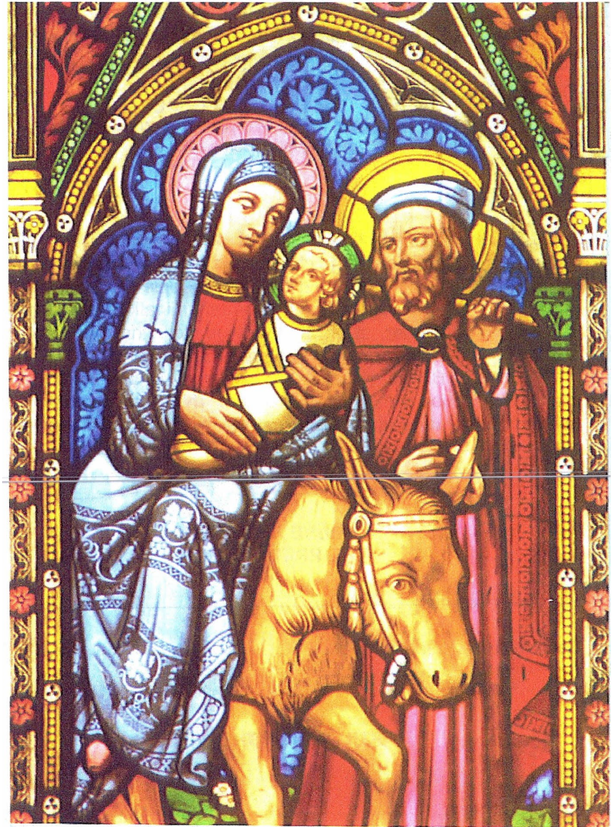
The Nativity of Our Lord December 25th Our Redeemer Lutheran Church